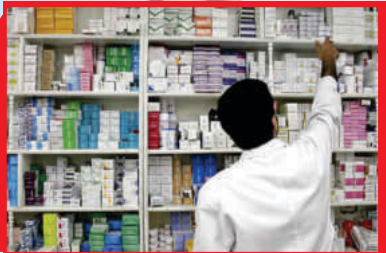
Medical Shop →