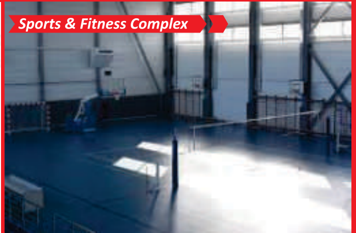
Sports & Fitness Complex →